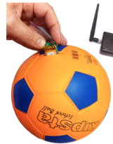
Figure 1. Foam ball augmented with a wireless inertial measurement unit. The sensors and emitter are inserted inside the ball. The receptor is connected to the computer.