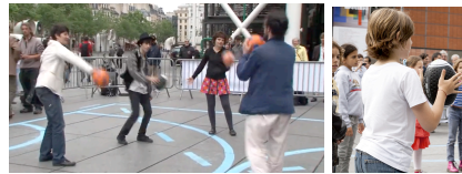
Figure 3. (top) UMG BasketBall. (bottom) UMG The Band. Presented at the Futur en Seine festival.

We believe UMG illustrates the potential of musical interaction based on playing techniques, a high-level behavior that embeds physical and metaphorical meaning. This concept could be applied to other non musical objects, e.g. cookware 1 .